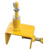
CCJC Joist clamp