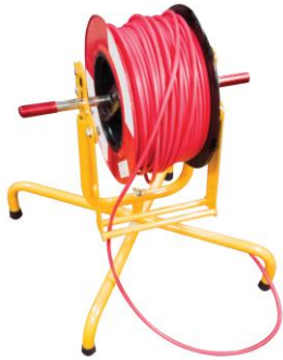
CCSSH Single head unit